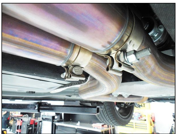
Figure 2 - Down pipe to X-pipe clamps