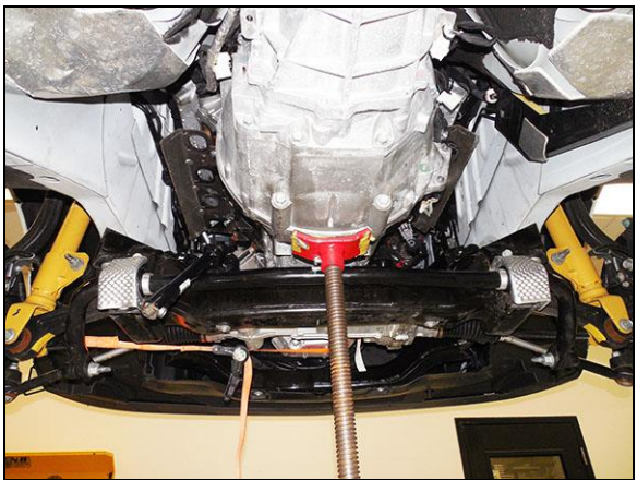
Figure 3 - Engine support and tie strap