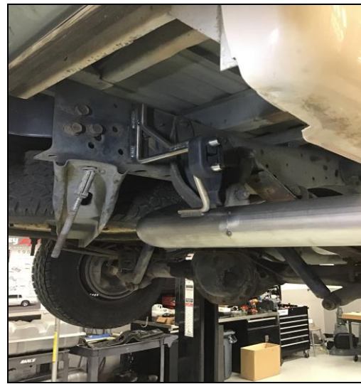
Figure 2 Rear tailpipe hanger to frame

NOTE: The intended attachment holes are sometimes occupied by rivets holding a specific stock exhaust hanger to the frame. You must remove the rivets and the stock hanger to enable proper installation of the supplied hangers. A cut-off wheel or grinder can be used to efficiently remove the rivet head prior to driving the rivet out of the hole with a punch and chisel.