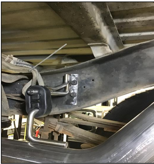
Figure 1 After muffler hanger rod attachment to frame