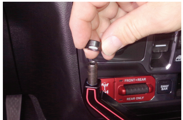
19. Run the jam nut (2) all the way down the knob screw, with the wrench flats facing down.