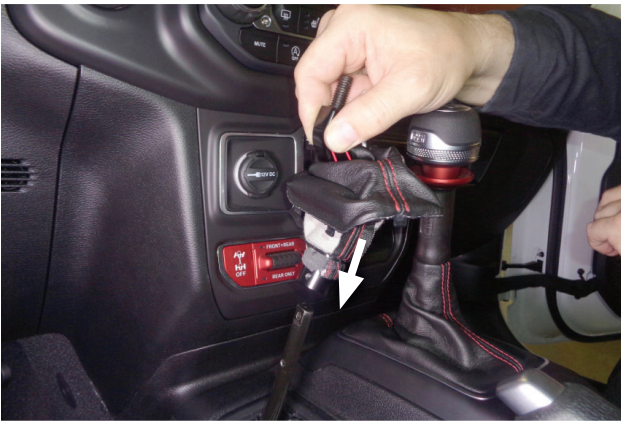
15. Install the shift handle and boot over the shift lever.