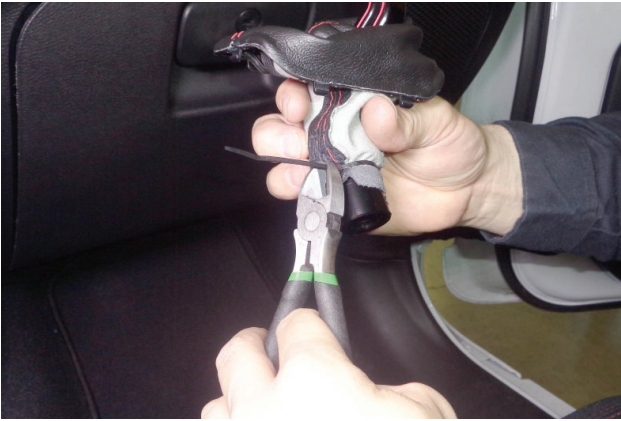
14. Trim the tail off the cable tie.