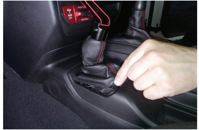
17. Pull the shift boot down and snap the boot frame into the center console.