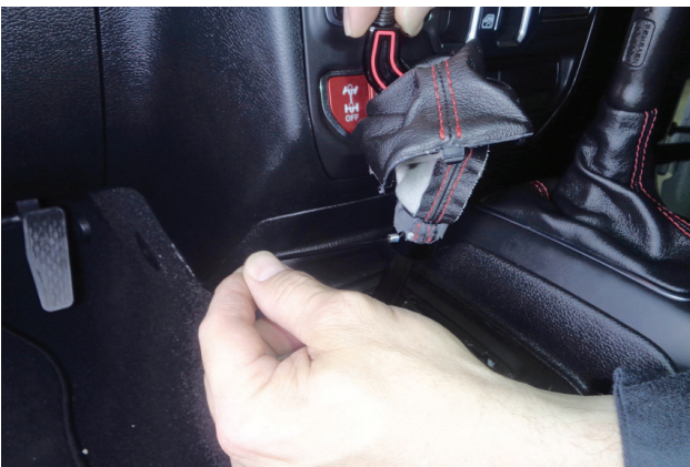
16. Apply medium strength thread locking fluid to set screw (5) and install it in the shift handle.