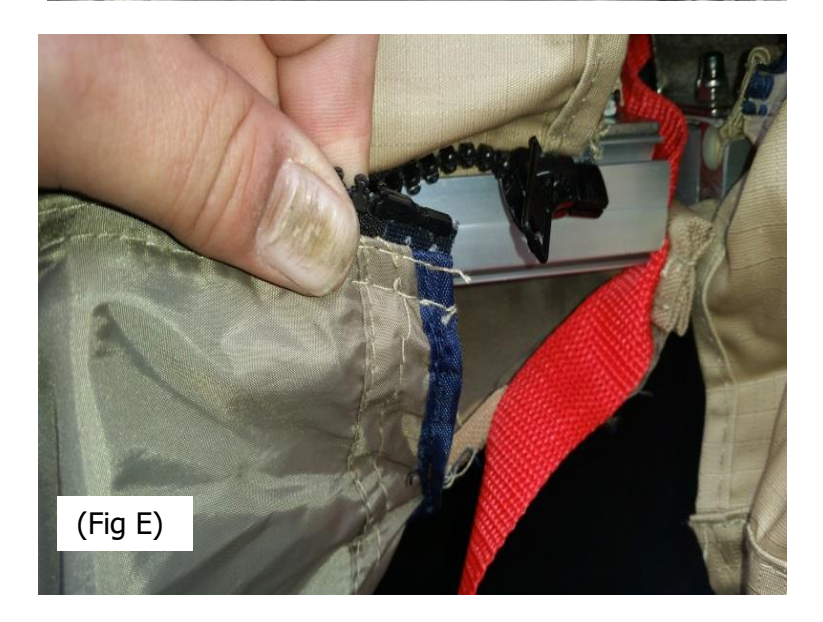
Step 2: Connect the zippers on the Annex to the zippers on the base of the tent. (Fig E,) Slide the left zipper along the edge and stop a few inches after you get around the corner, then connect the right hand side zipper and zip it up 8", then go back to the left zipper and complete zipping it up.(Fig E) The go back and complete zipping the right side zipper. Note: On the standard size tent: The Ladder goes on the outside of the Annex and annex will secure to the tent via Velcro strip near the ladder (Fig F, G). XL tent uses one long zipper and ladder will be inside the annex.